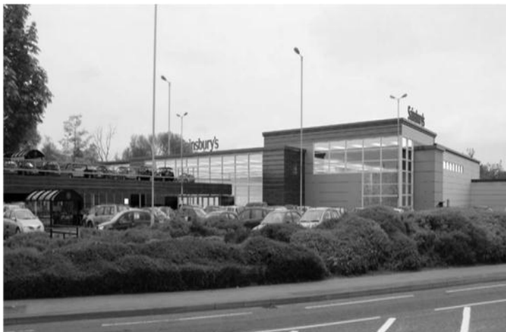
Indicative view of permitted store front design (with car park deck)

The first, which was approved, incorporated a single storey car deck across the whole of the frontage. We argued long and hard against this proposal and against the enormous expanse of window that was proposed. Quite apart from the design which was completely out-of-context