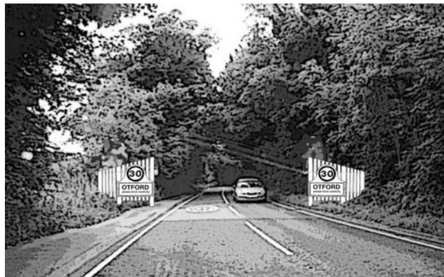
This drawing gives an idea of a gateway It is not the actual design