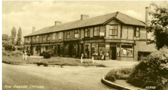
In the 1950s