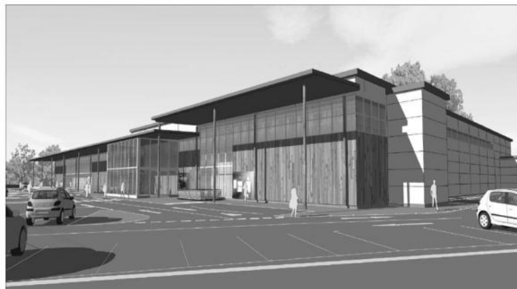
Indicative view of proposed revised store front design (without car park deck)

entirely unsuitable and in no way reflects the local vernacular. It gives the design more of an appearance of an airport terminal. The illustrations do not show that in reality you will see a lot of the existing terra cotta tiling above the store frontage and it would seem natural that this local colouration and material also be incorporated in the design.